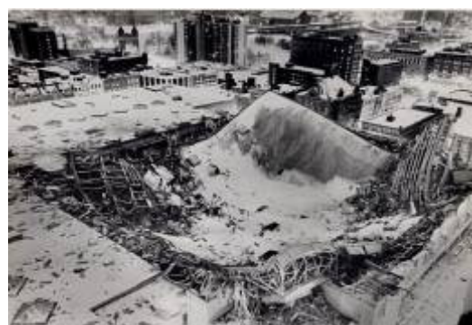
Figure 7 – The fall of a sports arena in the city of Hartford (USA), 1978