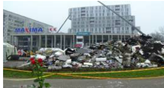
Figure 10 – The collapse of the Maxima Shopping Center in Riga, 2013

supermarket walls deformed, numerous customers and workers were locked inside. At 18:00, one of the center walls fell and the roof over the ticket offices fell. At noon on November 23, the number of deaths reached 52 people: 51 Latvians and one Armenian citizen. The Latvian police put forward three versions of the disaster: 1) violation of the design; 2) violation of the rules of construction; 3) storage on the roof of building materials [25].