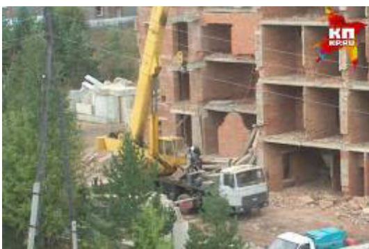
Figure 4 – The destruction building during construction, Ural, Russia, September 2016

On the same day, at 17 o'clock, the press service of RIA VistaNews reported on the collapse of an unfinished residential building in the Urals (Fig. 4), resulting in serious injury to one of the workers. The incident took place in the Sverdlovsk region. According to preliminary information, the workers carried out the building structures dismantling of an unfinished dwelling house. During these works, the one floor overlap could not withstand the load and collapsed on the worker. At the moment, the commission operates on the scene of the accident, which, as a matter of urgency, must provide a legal assessment of the incident [17].