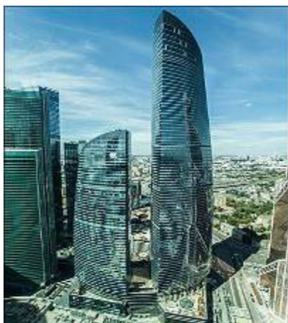
Figure 13 – Modern complex «Federation», Moscow, Russia

accident. A striking example of working out the past years' experience, the implementation of necessary improvements and the various accidents types prevention is the modern complex «Federation», which consists of two skyscrapers of 324 meters high (Fig. 13) [30].