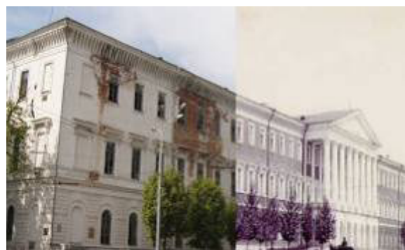
Figure 5 – The appearance of the Cadet Corps in Poltava at present, and in the XIX century

We give additional examples of this type accidents. Namely, in January 2010 in Tbilisi, Georgia, there were just two accidents. At first, the carrier wall of a residential three-story building collapsed, a day later - carrying two-story structures. In both cases, the buildings were in a emergency state. It should be noted that emergency measures were not carried out before the collapse. Fortunately, there are no victims [7].