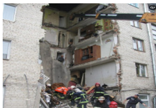
Figure 6 – Building collapse, Lutsk, Ukraine, 2012

due to design failures, such as in January 1978 in the city of Hartford, Connecticut, USA, due to overloading with snow in the city center, where a hockey match was conducted during the day, overnight collapsed on the night from a height of 30 m a sports arena measuring 92 by 110 m (Fig. 7). The investigation revealed errors in the calculations of designers [23].