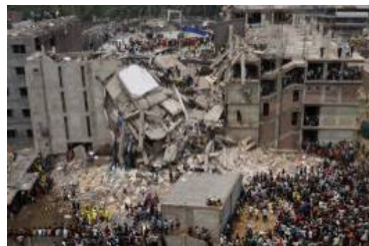
Figure 11 – Collapse of the complex in the city of Savar (Bangladesh), 2013

The record number of dead and wounded in the last decade has been recorded in 2013, when in Savar (Bangladesh) on April 24, a complex containing a bank branch, a shopping center with lots of stores and five sewing factories was destroyed (Fig. 11). On May 9, the death raised to 953 people, more than a thousand people were injured.