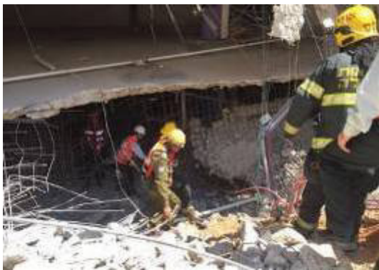
Figure 3 – Building collapse in Tel-Aviv, 2016

For example, at 13:00 on September 5, 2016, the Israeli police press service announced a building collapse in Tel Aviv (Fig. 3) that was in the construction phase, leaving two people dead and five more missing. The mobile crane, which drove on the multi-storey car park roof on Ha-Barzel Street in the Tel-Aviv district of Ramatha-Khayal, dropped off the building part that could not bear the weight of a huge machine [19].