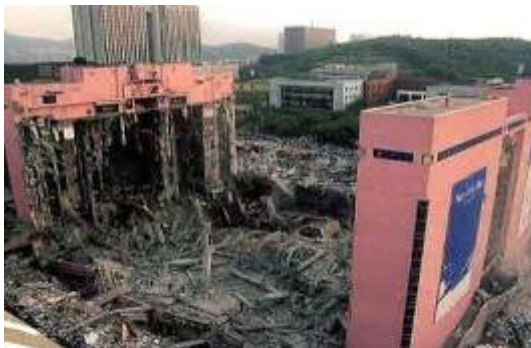
Figure 8 – Collapse of the Sampoong shopping center, Seoul, South Korea, 1995

It is impossible to ignore the most serious accidents over the past two decades, which resulted in dozens, but not hundreds of casualties and thousands of wounded. These include the Sampoong shopping center collapse in Seoul (South Korea). On June 9, 1995, one of South Korea's largest buildings - the largest supermarket in Seoul, Sampoong, collapsed. Under the building ruins, 502 people died, 937 were injured and serious injuries. According to the investigation, it was discovered that a building whose collapse lasted only 20 seconds collapsed due to a number of reasons, the main of which were violations of building codes (Fig. 8).