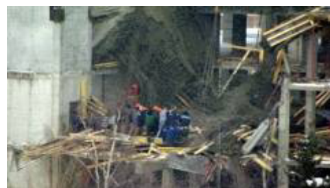
Figure 2 – Building collapse in Surgut, 2014

In November 2012, in Alexandria, Egypt, 10 people were killed when the high-rise building under construction collapsed. Late in the evening, the eleven-story building collapsed into neighboring buildings. All the dead and wounded - the inhabitants of these houses [13].