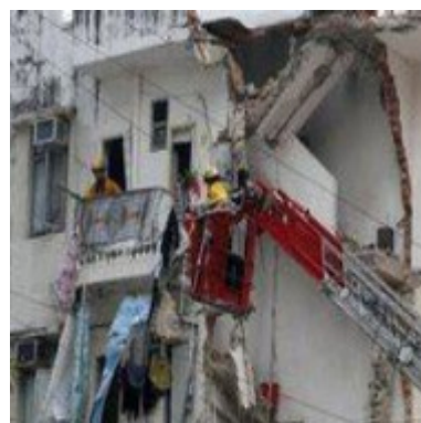
Figure 1 – Building collapse in Hong Kong, 2010

As a result of the study, a table was created showing examples of accidents and structures in recent years with available information on their destruction, the location and incident causes, as well as the number of victims.