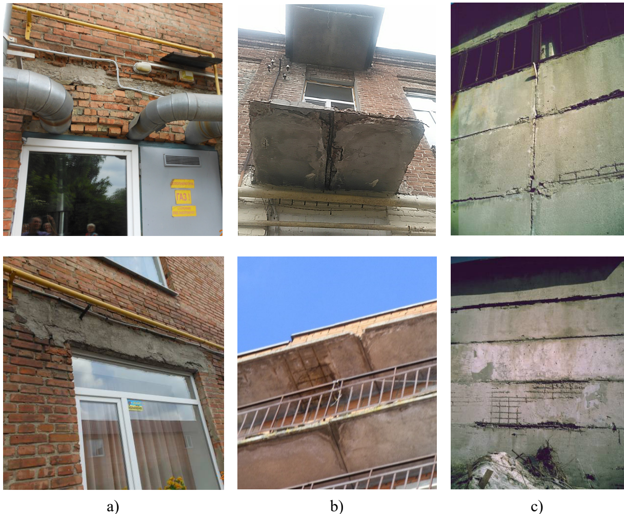
Figure 5 – Destruction of protective concrete layer of reinforced-concrete lintel (a), balcony plate (b), wall panel (c)