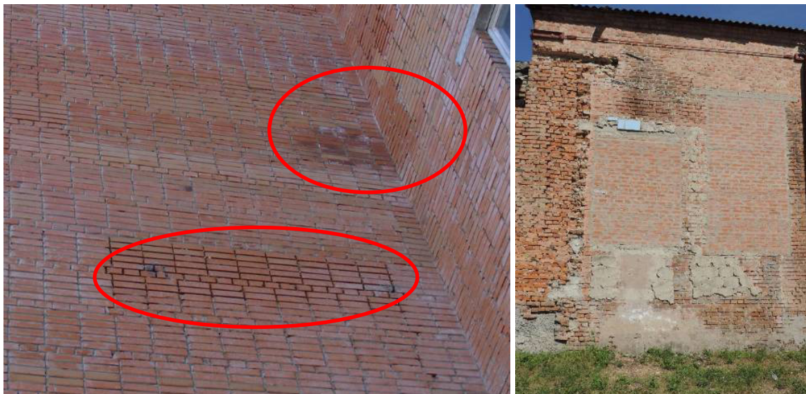
Figure 1 – Mortar ablation, brickwork frost destruction, the brickwork fragments fall, buildings enclosing structures brickwork local emergency sections due to the operational moisture impact

Main material and results. A special effect on buildings bricks enclosing structures has ground, atmospheric, operational, hygroscopic and condensed moisture. Operational moisture is available in premises with wet processes (showers, baths, car washes, etc.), increased moisture level inside the premises leads to soaking of brickwork that increases its thermal conductivity. Moistened brickwork has intense sorption processes of brickwork moisture extension vertically and horizontally. Traditionally, such processes are clearly visible on building face (see Fig. 1), they result in mortar ablation, active brickwork frost destruction, the brickwork fragments fall, formation of buildings enclosing structures brickwork local emergency sections.