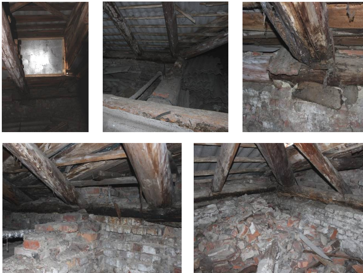
Figure 6 – Damage to wooden construction covering due to atmospheric and condensed moisture effect

For buildings wooden enclosing structures, the most dangerous is the atmospheric moisture effect. Thus, for loft wooden constructions, moisture effect arises due to defects in roof (atmospheric moisture) as well as incorrect design of ventilation framing scheme (condensed moisture) (see Fig. 6). In order to exclude atmospheric moisture effect, it is necessary to repair the damaged roof timely, there shall be eaves gutter and pectinal airway and roof windows designed on the loft in order to avoid formation of condensed moisture, their area should be 1/300 – 1/500 of the loft space. Typical for wooden floor construction is operational and condensed moisture effect. For normal operation of wooden floor constructions, it is necessary to make airways under the floor that should be opened during the spring, summer and autumn. It is also necessary to carry out fire retardant and antiseptic treatment of wooden constructions