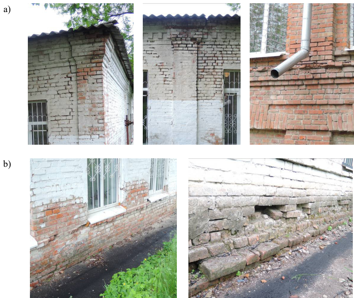
Figure 2 – Atmospheric moisture effects to brickwork of buildings enclosing structures: a) mortar weathering, frost destruction of the brickwork; b) water-saturation of the sole plate as a result of spraying water, fall of the brickwork fragments

Soil moisture effects on the buildings enclosing structures brickwork as a result of destruction or lack of horizontal waterproofing, in case of banked up building sidewalks level above the level of horizontal waterproofing (see Fig. 4).