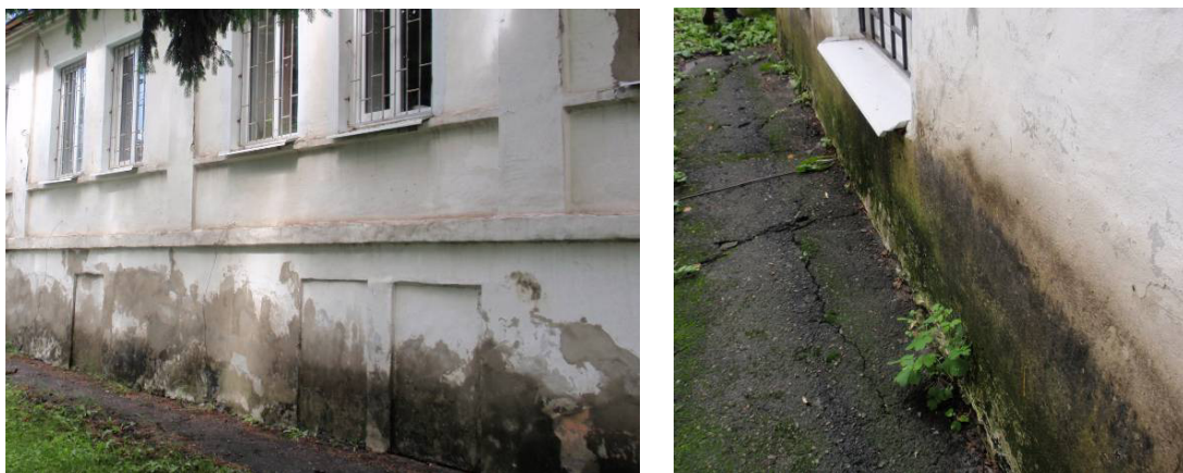
Figure 4. – Soil moisture effect as a result of destruction or lack of horizontal waterproofing, in case of banked up building sidewalks level above the horizontal waterproofing level

Construction moisture in the buildings enclosing structures brickwork leads to thermal conductivity increase within first 2–3 years of operation, as well as it can lead to formation of mold on construction surface, contractible non-uniform deformation of the building. In order to reduce the influence of initial moisture effect on the buildings enclosing structures, it is necessary to provide the building heating and ventilation system normal functioning.