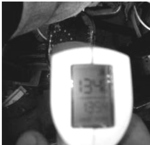
Figure 4 – The temperature definition with «Laserliner» laser pyrometer

In order to determine the optimum vulcanization and mathematical dependence regimes describing this process, the experiment planning was applied. Since the main factors influencing the vulcanization process are the heating element temperature and the pressure on