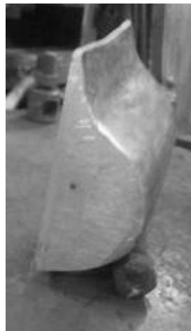
Figure 3 – A new baked form