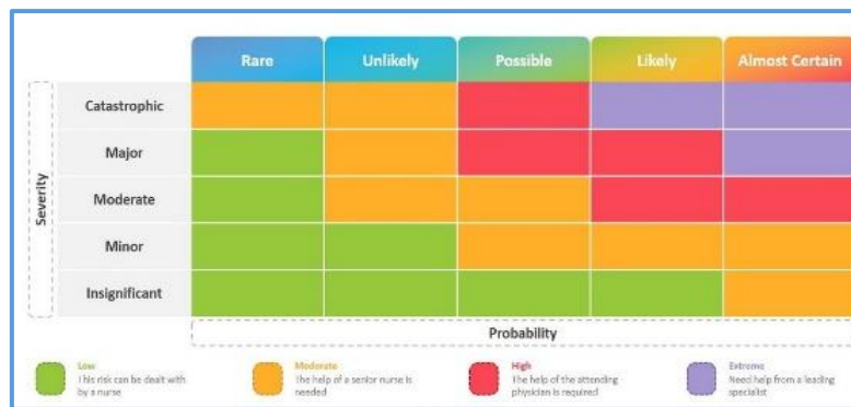
Fig. 1. Risk ranking and matrix of probabilities and consequences

6. Infringement of copyright (grade 2) - acceptance of risk . It is difficult to follow all competitors, and if someone has claims, it will be difficult to prove the fact of plagiarism in court.