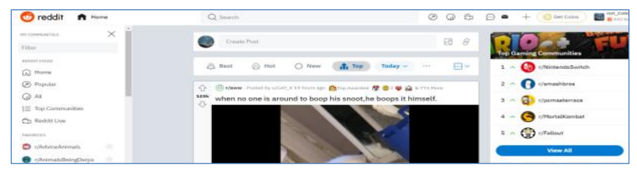
Fig. 1. Infotainment system «Reddit»

When you first meet Reddit, it can scare you away with the amount of "information overload" (Fig. 2), as well as the almost complete absence of content in the native language.