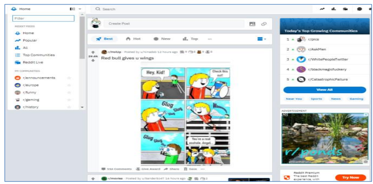
Fig. 2. Reddit homepage