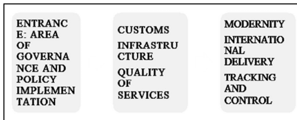
Fig. 1. Implementation of management decisions in logistics

The scheme for the implementation of management decisions in logistics is shown below (Fig. 1).