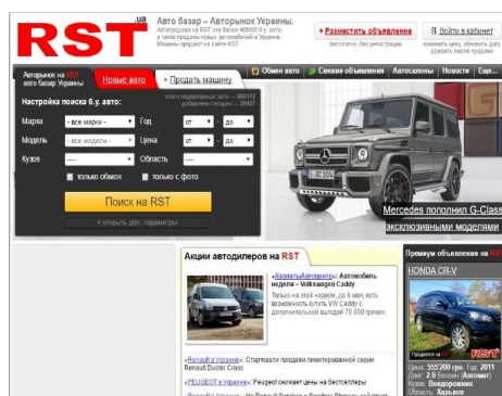
Fig. 1. Typical website on car sale

The work purpose - improvement of quality of reproduction of information from automobile subject by creation of an Internet resource.