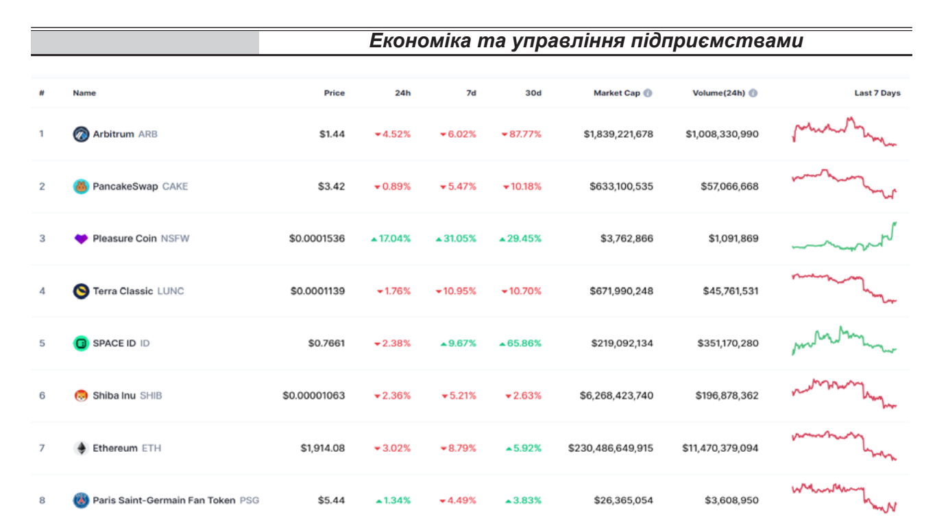
Figure 2. Trending cryptocurrencies on CoinMarketCap