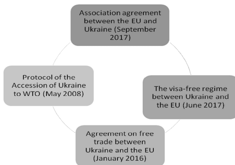
Fig.1 Basic agreements that regulates the relations between the EU and Ukraine

As specified by A. Lewandowska, considering Polish membership in the EU, economic cooperation between Poland and Ukraine also takes place based on agreements signed between Ukraine and the European Union [1]. Let us consider basic documents regulating the bilateral relations between the EU and Ukraine in fig. 1.