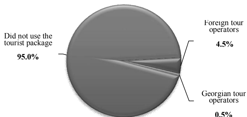
Fig. 2. Structure of tourist packages use by international visitors

In 2018, measures were taken to improve the competitiveness of international tourism and to occupy an appropriate place in the world tourism market. These procedures require competent personnel in this area, which is lacking. In order to improve the quality of service to tourists, various training courses are constantly functioning. In 2018, 1770 people were retrained in the tourism sector.