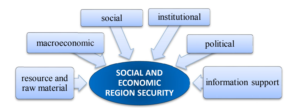
Fig. 2. Factors influencing the level of regional social and economic security

Social and economic security on the regional level is a complex notion which includes other types of security, namely: institutional, resource, financial, energy, investment, innovation, social, ecological, food supply and others. According to data and other components it is useful to create a system of indicators which will enable estimation the condition and dynamics of social and economic security in the region. There is no single scientifically-based system of social and economic security indicators. Indices characterizing social and economic security condition can include macroeconomic, production and social ones.